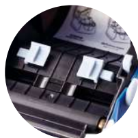
Support Multi-type of Labels