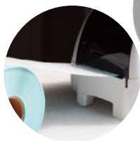
Support External Paper Feeding