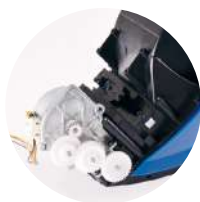
Big Gear, High Reliability